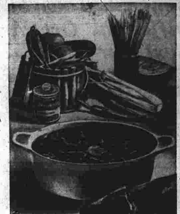
Big Soup from Italy: Minestrone means "big soup" in Italian—and it's full of good things.

Method: Put beef, water and salt in a 4-quart kettle. Cover and simmer until meat falls off the bone. Remove bones and meat; return stock. Diced bones cut up all meat into small pieces and return to stock. Add celery, carrots, snap beans, potatoes, cabbage, kidney beans (including liquid in can), tomatoes (including liquid in can), onion, garlic powder, parsley, pepper, and spaghetti. Cover and simmer 30 minutes or until vegetables and spaghetti are soft. Serve with grated cheese. Makes 4 quarts, enough for 16 servings.